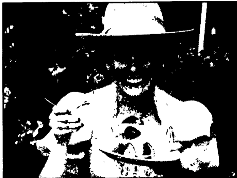
Strawberry Shortcake takes center stage at the fifth annual Berry Festival, Kitchen Kettle Village, June 16-17. The festival features numerous berry-related activities, live music, and entertainment. Kitchen Kettle is located on Rt.340 Intercourse, 10 miles east of Lancaster.