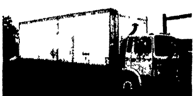
1988 MACK MS250 26' Dry Van Body, 5-Speed Trans., 175,000 Miles

20 -1995 Mack E7-350 RTLO14610B 10 Spds., DS404 - 3.9OR on Air, Steel Disc Hub Pilot, 295/75R 22.5 192 WB, 42" Highrise, 440,000 Miles