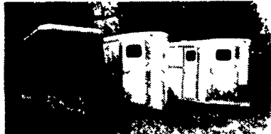
2-Horse Trailers by Bison, Phoenix, Cherokee