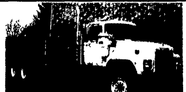
2000 MACK RD688S E7-427, RTOF-14908LL, 18 Front, 44 Rear Axles, 265 inch W.B. (Can Change W.B.)