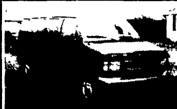
1999 FORD XLT E150 CLUB WAGON , 4.6 V8, Auto, PS, PB, PW, PDL, Cruise, Tilt, Dual Air, AM/FM/ CASS, 13,000 Mi. w/Bal. of Factory Warranty, Dark Blue..... $19,500