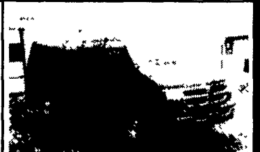
1999 DODGE 2500 , 8 Pass., 318 Auto, PS, PB, PW, PDL, Cruise, Tilt, Dual Air, AM/FM/CASS, 19,000 Mi., with Bal. of Factory Warranty, Dark Green..... $17,900