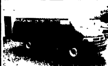
1999 DODGE 15 PASS. , 360 Auto, PS, PB, PW, PM, PDL, Cruise, Tilt, Dual Air, AM/FM/CASS, Michelin Tires, 16,000 Mi. with Bal. of Factory Warranty, Black..... $20,500