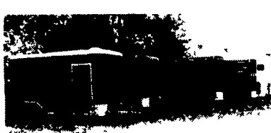
2- Horse Bumper Pull Trailers In Stock