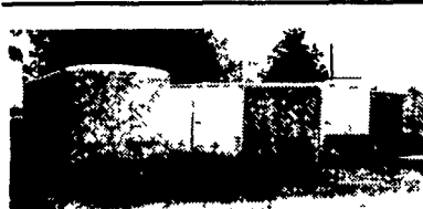
50 Enclosed Trailers In Stock