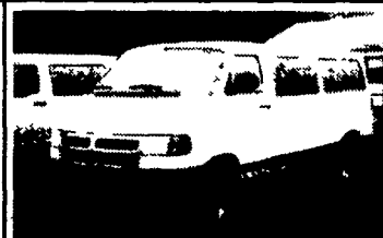
1999 DODGE 2500 , 12 Pass., 318 Auto, PS, PB, PW, PDL, Cruise, Tilt, Dual Air, AM/FM/CASS, 24,000 Mi. with Bal. of Factory Warranty, White..... $18,500