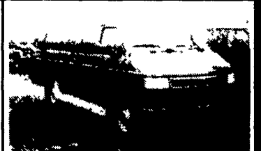
1997 DODGE SLT 3500 , 15 Pass., 360, Auto, PS, PB, PW, PDL, Cruise, Tilt, Dual Air, AM/FM/ CASS, 39,000 Mi. with Transferable 100,000 Mi. Warranty, Dark Green.. $17,500