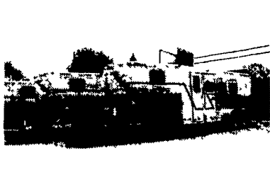
Gooseneck 3 & 4 Horse Trailers, All Aluminum, Ready To Go