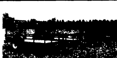
Big Tex Open Trailers 8' to 18'