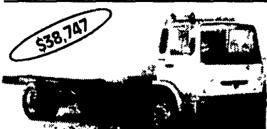
2000 MACK MS250P Chassis, E3-190, 4106A-6 Spd., 12 Front, 21 Rear Axle, 217 W.B.