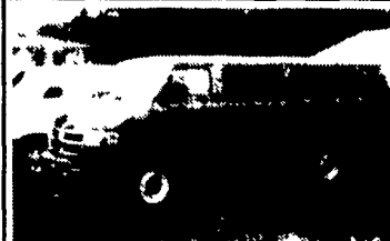
1999 DODGE 15 PASS. , 360 Auto, PS, PB, PW, PDL, Cruise, Tilt, Dual Air, AM/FM/CASS, 25,000 Mi. with Bal. of Factory Warranty, Dark Green..... $19,900