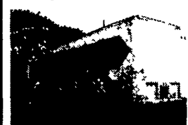
Storage Van Trailers, 42' to 45' Starting at Only $1,400