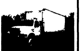
1991 IHC 4800, DT466 210 Hp, Just Rebuilt, 6+1 Trans, P/S, A/B, 22' Van, 33,000 GVW, Insp., Very Clean Priced To Sell