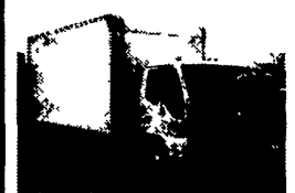
1999 Chevrolet/Isuzu, W4500, 4 Cyl., Turbo, 5 Spd, P/S, A/C, 86,000 Miles, Like New, 14' Van Body... $19,900