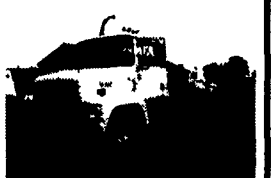
1990 Ford LN8000, 7 8 Liter, 6 Spd, P/S, A/B, 32,800 GVW, 22' C&C, Insp. Very Clean Call For Details