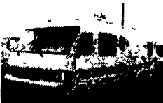
1997 DAYBREAK BY DAMON 33' Motor Home, 460 V-8 Ford Central AC & Heat, Rear Camera, Driver Door 17 000 Miles $37,000