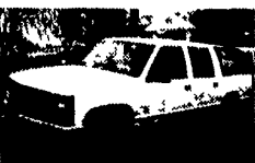
94 GMC SUBURBAN 2500 350 V-8 Auto PS, PB AC Barn Doors Over The Miles $8,995