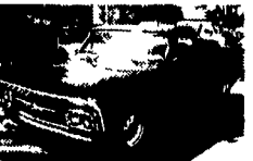
70 GMC SHORT BED TRUCK 454 V-8 Auto 3 "Chop Top" Nova Sub Frame 9" Ford Tubbed Rear $12,500