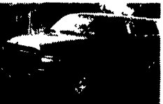
95 DODGE RAM 1500 LARAMIE SLT Ext Cab, 4x4 V8 5 Speed Equipped Over 100 000 Miles $10,500