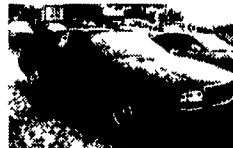
88 CADILLAC ELANTE 2 Tops 83 000 Miles $7,995