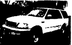
98 FORD EXPEDITION XLT 5.4 V8 Triton Equipped 3rd Seat $19,500