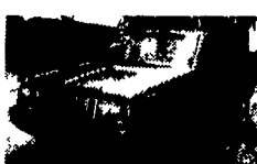
95 JEEP GRAND CHEROKEE 4X4 6 Cyl, Auto PS PB AC $8,899