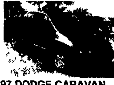
97 DODGE CARAVAN V-6 Auto PS, PB AC 104 000 Miles $7,995