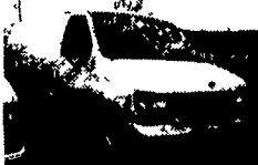
93 FORD F250 Work Van 3006 Cyl Auto PS PB AC $5,995