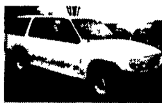
95 FORD EXPLORER XLT 4x4 V-6 Auto PS PB AC Equipped, 119 000 Miles $9,995