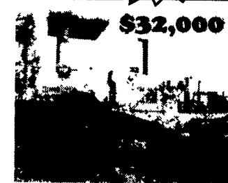
'86 Cat D4H Excellent