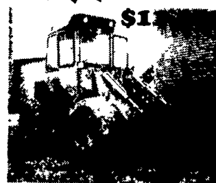
JD 544A Wheel Loader