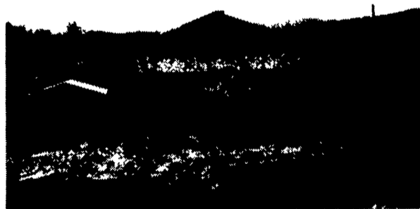
Knepper Farms 3 Springs PA, Fulton County 200 Head Deep Pit Freestall Barn