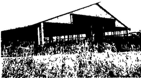
Meadow Wood Farms, Lebanon, PA 350 Cow Freestall Barn w/Sand Bedding and Flush System

Call Farmer Boy Ag Systems For Your New Construction and Equipment Needs!