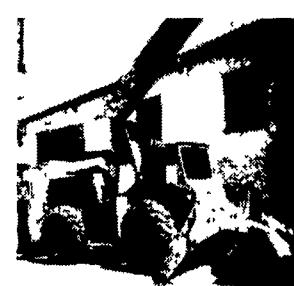
Clark Crane, 14 Ton Capacity 4-53 Detroit, 60' boom, 14 00x24 tires, runs good, serial #720