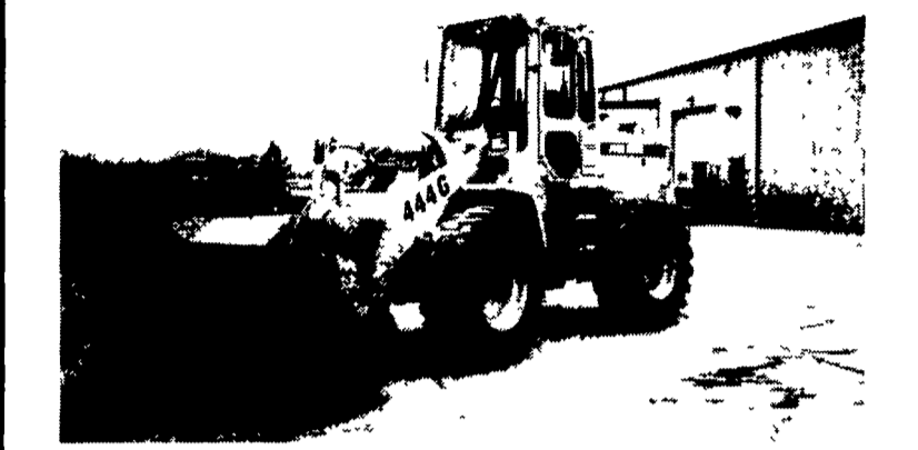
JD 444G, Cab, 2,300 Hrs., Clean & Orig. $54,500