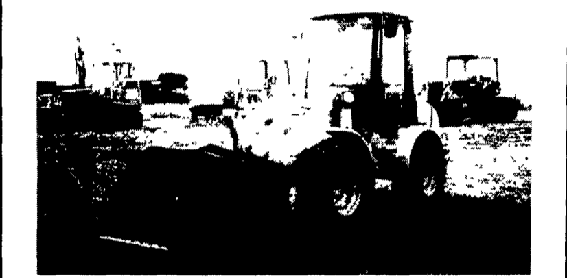
JCB 409B, 3,000 Hrs., Cab, QT Bucket, $37,500