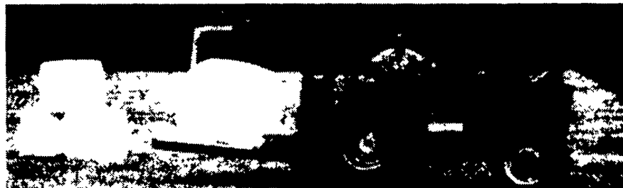
The EC04-5 Pull Behind Wrapper For Use On Small Tractors