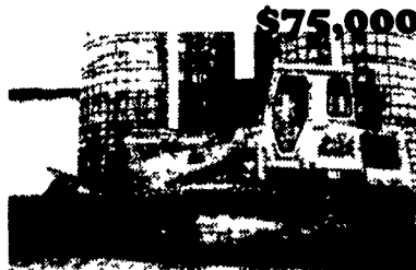
'94 Cat 963

All Machines Listed For Sale Are Also For Rent