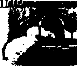
Chore-Time's MODEL C2 Feeder For Improved Conversion