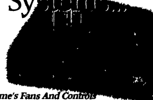
Chore-Time's Fans And Controls Offer Efficient Performance

Here are just a few of the reasons to choose Chore-Time for your next feeding, drinking, or ventilation system: