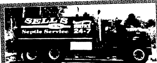
1977 MACK R MODEL, 300 Motor, 5 Spd., 3,300 Gal. Tank, less Than 100,000 Mi. On Motor, Excellent Condition $32,500 610/826-4381