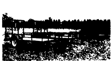
Big Tex Open Trailers 8' to 18'