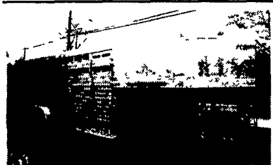
24' Gooseneck 8' Wide, 7' High, 7,000 Axles, 2 Center Dividers - In Stock! $12,500