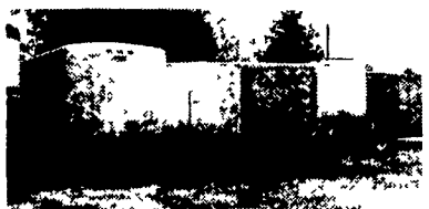
50 Enclosed Trailers In Stock