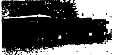
2- Horse Bumper Pull Trailers In Stock