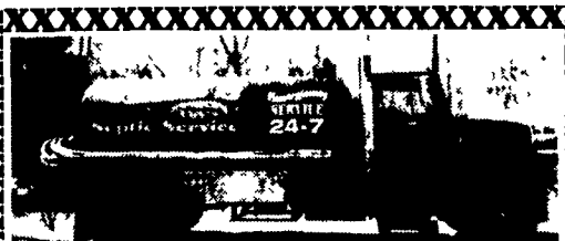
1992 Ford L8000, 5-Spd. - 2 Spd. Rear, 2,500 gal. tank, 92,000 mi., Excellent condition. $40,000 610/826-4381