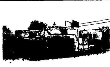
Gooseneck 3 & 4 Horse Trailers, All Aluminum, Ready To Go