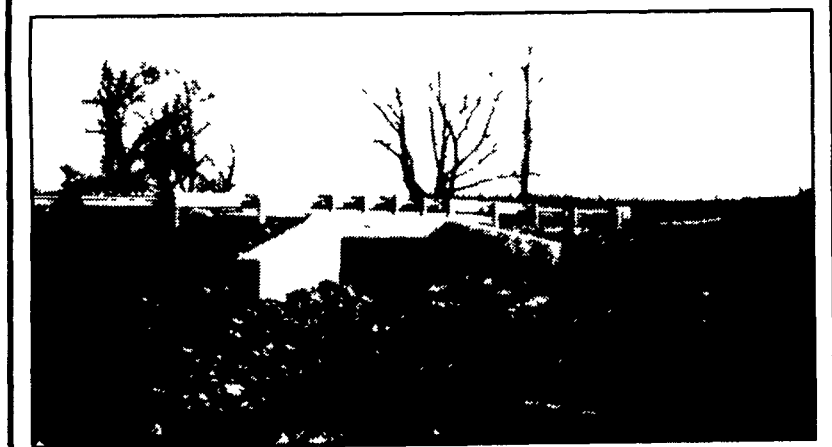
Lancaster Poured Walls, Inc. Concrete Construction

2001 Jarvis Road • Lancaster, PA 17601 Help 717-299-3974 Concrete Pumping