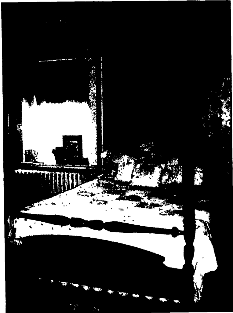
For the do-it-yourselfer, house tours offer ideas such as creating this bed canopy and matching window treatment.