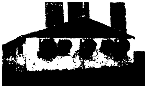
76 Cow Tie Stall Barn, Denver, PA