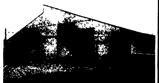
6 Row Free Stall Barn, Mt. Joy, PA