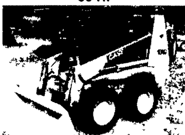
New 10 00x16 5 Flotation Tires, New 63" Dirt Bucket, Engine Block Heater, Work Lights $11,500 (UT 4467)

1997 Model Gehl SL 4625 Diesel Kubota Power