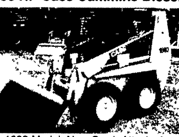
1993 Model, New Quick Attach, Aux Hyd , Self-Leveling Loader, 73" Wide Utility Bucket, Engine Block Heater, Work Lights, Sold New, One Owner $12,900 (UT 4319)

Case 1840 Uniloader 50 HP Case Cummins Diesel