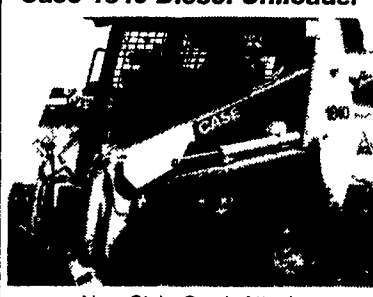
New Style Quick Attach (UT 4457)