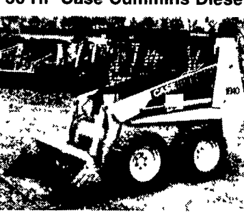
1994 Model, Only 667 Hours, Aux Hyd Outlets, 63" Dirt Bucket, Engine Block Heater, Nice Clean Loader $13,900 (UT 4463)

Case 1840 Uniloader 50 HP Case Cummins Diesel