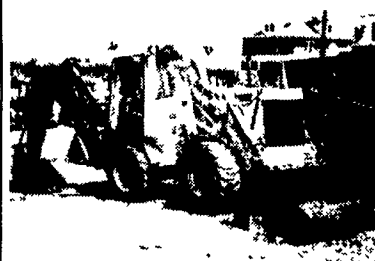
Ask About 6 9% Financing for 24 Monthly Payments! Water Cooled 48 HP Diesel Engine, 2 Speed lydrostatic Pedal Control, Loader with -in-1 Bucket, Approx 11 Foot Digging Depth, Great Cemetery Machine for Digging in Close Areas! $14,850 (UT 4455)

New Holland LB620 Articulated 4-Wheel Drive Backhoe & Loader Tractor