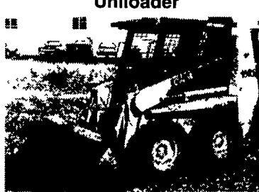
Large Capacity Utility Bucket (UT 4487)