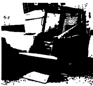
Case Cummins Powered, 1990 Model, 2404 Hours, 63" Bucket with Bolt on Reversible Cutting Edge Price On Request (UT 4483)