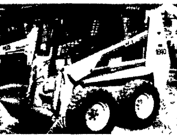
2276 Hours, Aux Hyd Outlets, New Large Capacity Utility Bucket, Deluxe Seat $13,500 (UT 4470)

996 Model Case 1840 Diesel 50 HP Uniloader