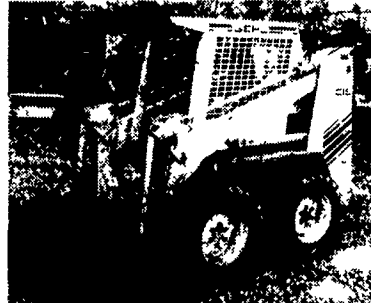
3,467 Hours, 1987 Model, Self-Leveling Loader, 2 New Front Tires & Good Rear Tires 10.00x16 5, Aux Hyd 65" Bucket with New Edge $8,650 (UT 4242)

Gehl SL4615 47 HP Diesel Construction Model