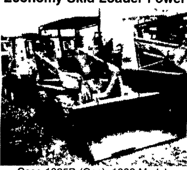
Case 1835B (Gas), 1982 Model, 3448 Hours, New 10 00x16 5 Flotation Lug Tires, Good 66" Material Bucket, Serviced - Ready For Work $5,500 (UT 4504)