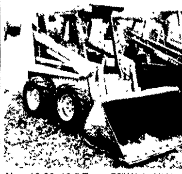
New 10 00x16 5 Tires, 73" Wide Utility Bucket, with Heavy Duty Bolt on Cutting Edge, Aux Hyd Outlets, Counterweight, Engine Block Heater, Halogen Lights, 3010 Hours, Serviced, Ready to Work! $12,900 (UT 4468)