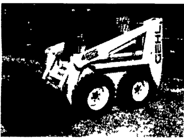
Only 1,190 Hours, Self-Leveling Loader, 65" Wide Utility Bucket with New Cutting Édge $13,900 (UT 4447)

1997 Model Gehl SL 4625 Diesel Kubota Power