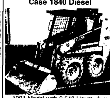
1991 Model with 2,548 Hours, Aux Hyd , Self-Leveling Loader, Deluxe Seat, 63" H D Construction Bucket $12,500 (UT 4154)

New Holland LB620 Articulated 4-Wheel Drive Backhoe & Loader Tractor