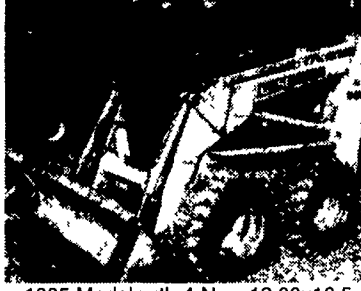
1985 Model with 4 New 12,00x16.5 Tires, 80" Wide Bucket, Good Paint $9,900 (UT 4401)

Gehl SL4615 47 HP Diesel Construction Model