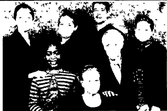
Gospel Express Evangelistic Team

The Gospel Express Evangelistic Team travels nearly 40-50,000 miles each year across the country sharing the Gospel in prisons, churches and communities, and 3rd world countries. Proceeds from the benefit auction will enable the team to continue to travel and share the "Good News" wherever God opens the door.