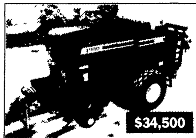
A 22444 1989 Hesston 4900 Baler, 26,000 Bales