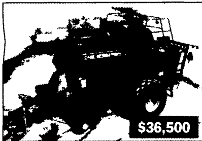
A 16564 1994 CIH 8580 Baler, 27,780 Bales