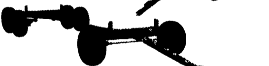
12 Ton Tandem- with "Easy Hook Up" tongue & rear hitch.