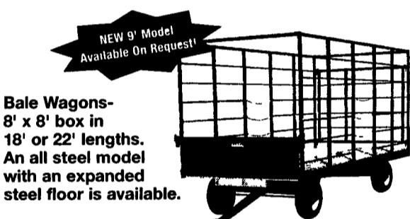
Bale Wagons- 8' x 8' box in 18' or 22' lengths. An all steel model with an expanded steel floor is available.