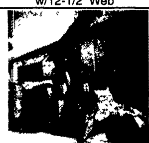
Clark Crane, 14 Ton Capacity, 4-53 Detroit, 60' boom, 14.00x24 tires, runs good serial #720

4 I-Beams, 49' Long, 28" High w/12-1/2" Web