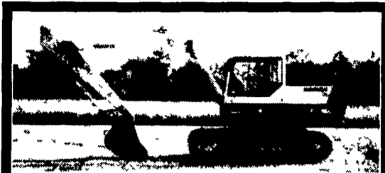
1997 KOMATSU PC 150 EXCAVATOR Superbly Maintained, Serial Number 7988 1300 Hrs., Excellent Condition $74,500 • (717) 438-3776