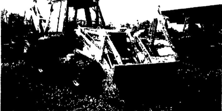
Case 580 Super K 4x4, Std. Stick, Cab, 2,100 Hrs. - $28,500