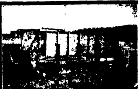
(1) VARIABLE SPEED FEED HOPPER w/ELECT. - $2,800 ★★★ 717-438-3354 ★★★