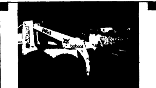
Bobcat Skid Loader, runs & operates very good. 1-800-839-3338