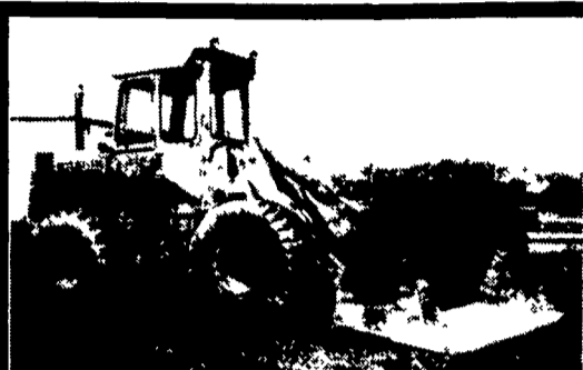
JD 644B PAYLOADER , 4 Yrd Bucket, Engine Rebuilt 2 Years Ago, Trans. Just Overhauled, 20.5x25 Rubber, Excellent Shape $19,500 • (717) 273-3823