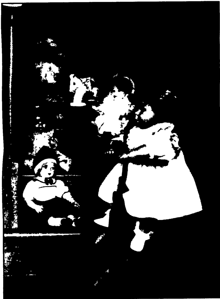
Her collection of dolls include these. One doll sits on an old wooden tricycle Elva found at a garage sale.