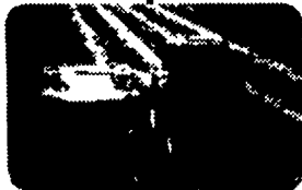
Disc mower conditioners

CLAAS offers a full line of equipment for nutrient-rich silage. Produce perfectly formed, dense bales with today's most reliable, technologically advanced heavy-duty fixed chamber and variable chamber round balers. Many models are available with the optional ROTO CUT® cutting system that pre-processes silage and adds greater density to each bale and choice of ROLLATEX® net wrap or twine. Disc mower conditioners, with heavy-duty cutter bars and your choice of roller or tine conditioner, follow ground contours for clean, even cutting. Reliable, heavy-duty tedders with 6 tine arms per rotor accelerate dry down. Dependable, heavy-duty rotary rakes, single and twin, with tandem axles produce uniform, fluffy windrows.