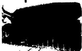
ROTO CUT cutting system