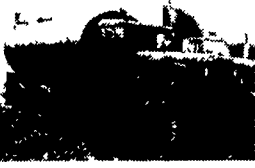
5 Ton All-Wheel Drive Army Truck with 3600 Gallon Husky Liquid Manure Tank

USA Body Slide-In Liquid Manure Tank Convert your truck to a nurse unit or field spreader in just minutes!