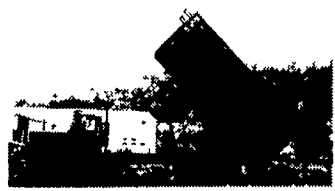
88 Mack 350, 9 Spd., Glider Kit w/2060 ALLStar