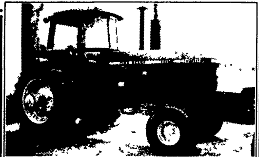
JD 4840 Cab, Power Shift, Duals $15,800

56 Forrest Manor Rd. Lincoln Univ., PA 19352 610-869-4477