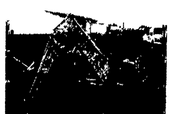
Bradco 11 MD 3 Pt. Hitch Backhoe w/Pump, Great for 40 to 80 HP Tractor