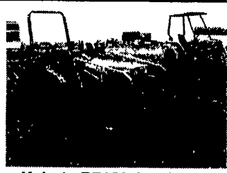
Kubota B7100 4x4, Hydro w/Loader, New Style, 600 Hrs., 60" Belly Mower Available