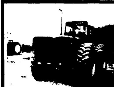
IH 3788 2+2 Engine, Trans. Rebuilt, New T/A, Clutch, Ill Remotes, Western Interior, New 20.8x38 Firestone Tires, Like New, Call

HONEY RUN REPAIR 540-879-9870 Dayton, VA