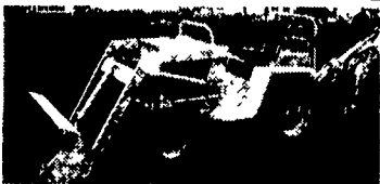
Terramite T5C Very Clean $8,900