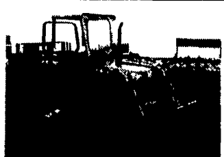
Kubota L2250 4x4 w/Loader & Belly Mower, 500 Hrs. (Mint Condition)