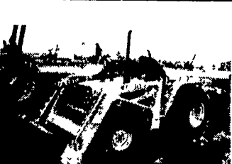
Kubota B8200 4x4 w/Loader 20 HP, Foam-Filled Rear Tires

JUST ARRIVED Kubota L3710, SOLD loader, 180 Hrs Soil Preparator, 72", For Skid Ldr Harley PRO 6 Rock Rake JD 6x4 Gator Kubota L35, TLB AgTech Pre Seeder Kubota B7200 4x4, 17 HP Woods Backhoe Model 750 Used Gooseneck Flatbed Trailer Bolens 4x4 TLB