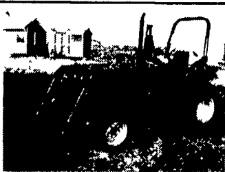
Case IH 255 w/Loader Only $8,900