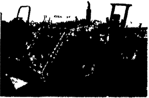
Kubota L345 4x4, 36 HP w/Loader - Only $10,500