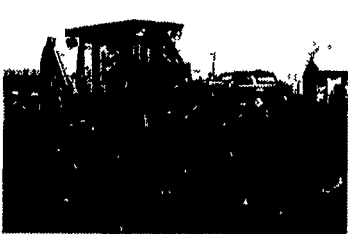
Kubota L35 4x4, TLB, 35HP, No Cab, 1500 Hrs., $19,500