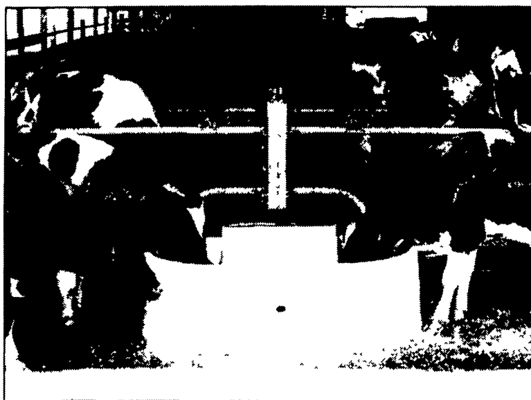
New Model #6100, BIGspring livestock waterer

The first waterers specifically designed for free stall installations