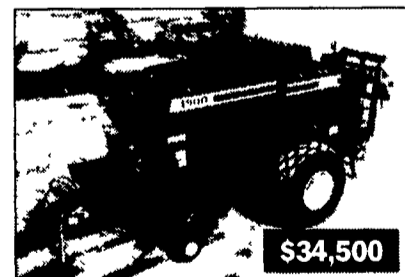
B 22444 1989 Hesston 4900 Baler, 26,000 Bales