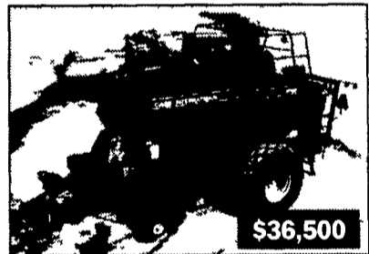
A 16564 1994 CIH 8580 Baler, 27,780 Bales