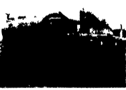
5 Ton All-Wheel Drive Army Truck with 3600 Gallon Husky Liquid Manure Tank

• 2000 Freightliner FL80 with Keenan 200 EF Feeder