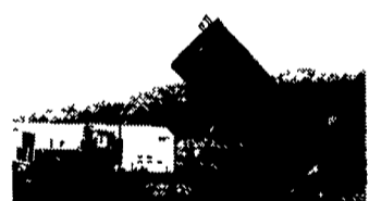
88 Mack 350, 9 Spd., Glider Kit w/2060 ALLStar

Work-Ready Units and USA ALLStar Ag Truck Bodies