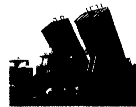
89 Ford LTL9000 3406B Cat, Fuller 8LL, 16,000 Front, 44,000 Rears on Hendrickson, Jake Brake, AC with 2260 ALLStar

• 87 R Model Mack, 350, 9 Spd., engine brake with 2060 ALLStar AG Body