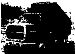
93 Ford Aeromax L9000, 350 Cat, 9 Spd., AC, 12 & 40 with 2260 ALLStar Ag Body