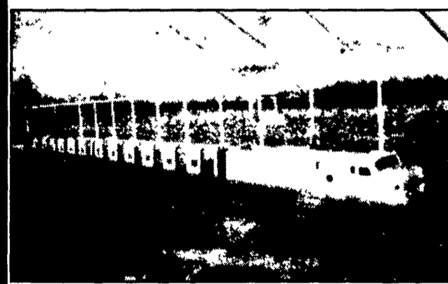
Train to take U-Pick Customers to strawberry and blueberry fields.