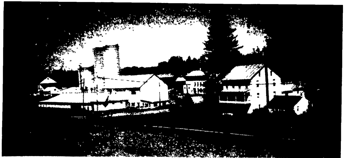
Del-Jame Farm near Hamburg in Berks County is a 1999 Dairy of Distinction winner. Since the program began in 1987 in Pennsylvania, more than 700 farms have been given this farm beautification award. Entries are now being received for the year 2000 program. Take time to enter your farm now.

Judging is conducted during the month of May. Award winners are announced during local June Dairy Month activities.