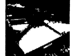
Woods MD184, 7' Rotary, Like New