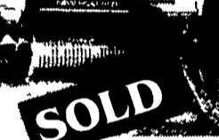
NH 316, 70 Hyd. Thrower, Hyd. Tension, Bright Paint