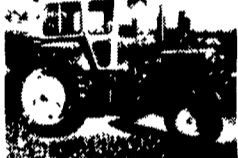
JD 4020, WFE, cab, super nice