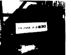
NH 630 Round Baler, Like New