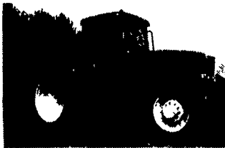
JD 7800 Tractor MFWD, Duals, 145 HP