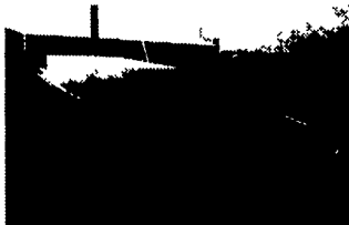
JD 1219 MoCo Excellent Rolls $4,200