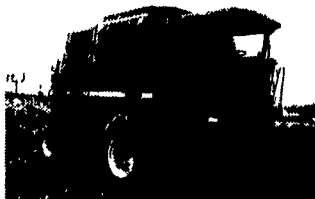
(2) JD 9500 Corn Combines, 1994 w/Chopper (1) 1310 Separator Hrs. (1) 1335 Separator Hrs. Choice $86,000