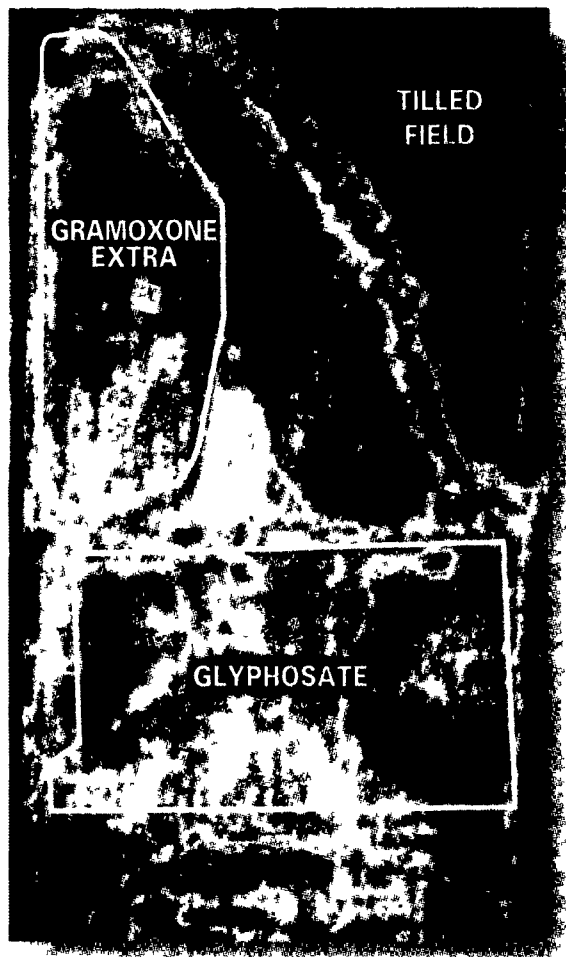
6 DAYS BEFORE APPLICATION - APRIL 19