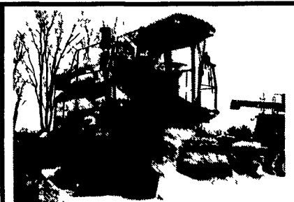
New Holland FX 25 Harvester, 1500 Cutter Hr., Corn Cracker, 4-Row Corn, 10-Hay $129,000