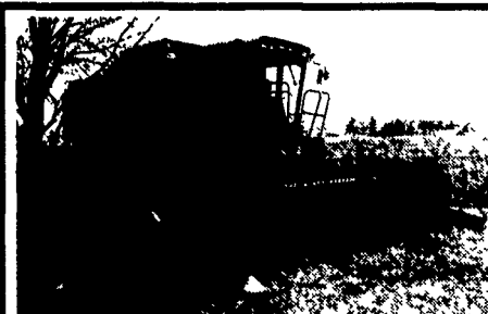
1994 Case IH 1688 4x4 Combine with 8 row corn 15' flex head, 20' flex head, 400 Hr $148,000