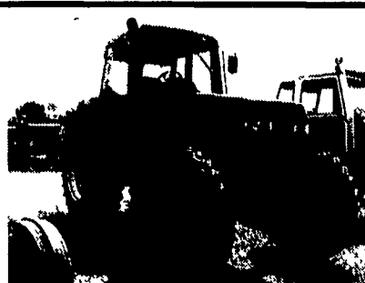
Case IH 7240 4x4, 195 HP, 1100 Hr $68,500