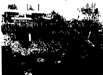
Brillion PDT 12 12 ft. PACKER w/Transport & Hyd Cylinder Hoses, 20" Ductile Wheels