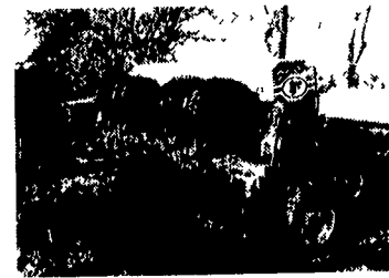
Tye 10 ft. NO-TILL DRILL w/Legume Box, 2"x13" Press Wheels, 7" Spacing, Rear Harrow Weight Kit, New Coulters & New Double Disc Openers