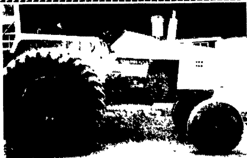
Case 1070, 3400 hrs., 3 pt. power shift, dual remotes, 18-4-R38 radial, 95% tread, new paint, $7,500 OBO 610-689-4121

Case IH 5100 18x7 Drill, Double Disc, Press Wheels, Grass Seed, Like New $4500; JD 7000 4RW Planter, Markers & Monitor, $2200. 717-776-4261