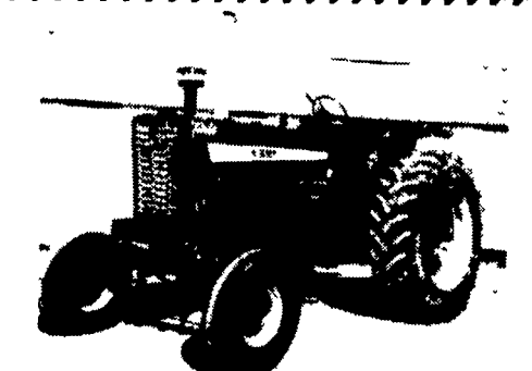
IH 1206 TA, dual hyd. $6,500 (717) 532-8926