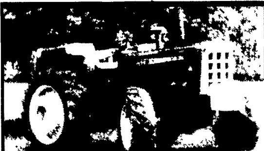
1969 Oliver 2150, 4x4, 135 hp, in nice original shape $11,000 OBO York, PA (717) 292-1252