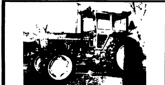
JD 2940 MFWD, only 1349 original hours. Garage kept, original owner operated, 16-spd. with Hi-Lo, 28 and 38 inch tires, dual hydraulics, enclosed insulated cab w/heat. AM/FM Cassette with weather band, 94hp on Dyno. Excellent condition! $23,600 Days (914) 454-7427 Evenings & Wkds. (914) 677-6158