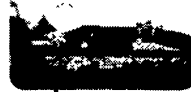
Big square balers