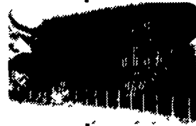
ROTO CUT cutting system