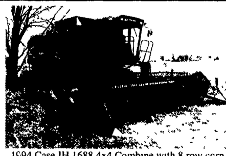
1994 Case IH 1688 4x4 Combine with 8 row corn 15' flex head, 20' flex head, 400 Hr $148,000