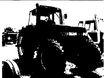
Case IH 7240 4x4, 195 HP, 1100 Hr $68,500