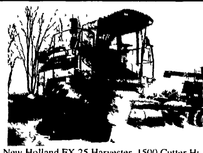
New Holland FX 25 Harvester, 1500 Cutter Hr., Corn Cracker, 4-Row Corn, 10'-Hay $129,000