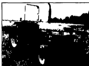
B 17219 1997 CIH C90 2WD ROPS, 362 Hours 18 4 R 30 Rear Tires 74 HP