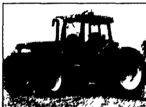
B 17596 1997 CIH 8930 MFD Cab, 784 Hours, 18 4 R 46 Rear Duals, 185 HP