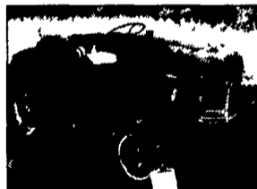
C 30941 1955IH 300 2WD Utility, 13 6 x 28 Rear Tires, 36 HP