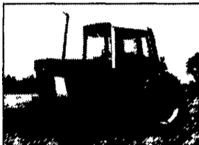
B 18119 1978 IH 1086 2WD Cab, 4700 Hours, 20 8 x 38 Rear Tires, 131 HP