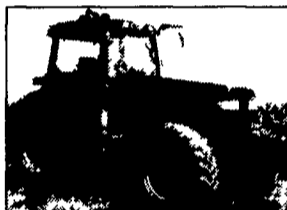
B 17774 1997 CIH 8920 MFD Cab, 2073 Hours, 18 4 x 42 Rear Duals, 155 HP