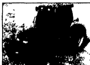
C 22719 1990 CIH 5130 2WD Cab, 1460 Hours, 18 4 x 38 Rear Tires, 86 HP