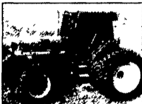
B 18756 1991 CIH 7130 MFD Cab, 6446 Hours, 18 4 x 42 Rear Duals, 172 HP