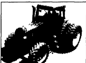
A 22330 1995 CIH 7250 Cab, 1766 Hours, 20 8 R 42 Rear Duals, 215 HP