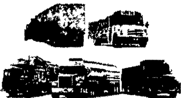
IN HOUSE TRUCK & TRAILER REPAIRS AND STATE INSPECTIONS