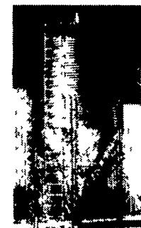
GSI GRAIN BINS AND TANKS