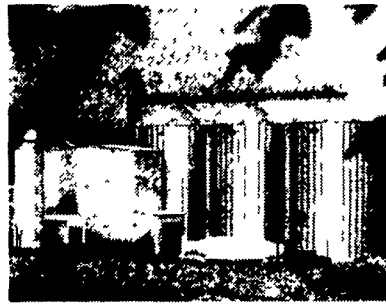
GSI GRAIN HANDLING SYSTEMS