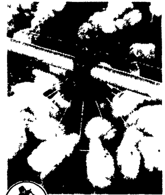
Big Dutchman. BROILER SYSTEMS