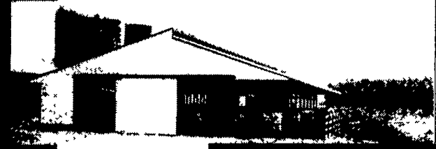
3 ROW FREESTALL BARN

Check with Agri-Inc. where quality is our standard.