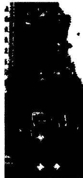
HARDI Manifold System