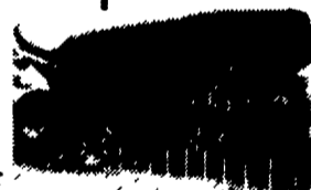
ROTO CUT cutting system