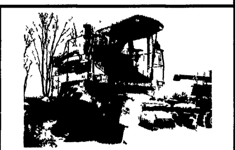
New Holland FX 25 Harvester, 1500 Cutter Hr. Corn Cracker, 4-Row Corn, 10-Hay $129,000