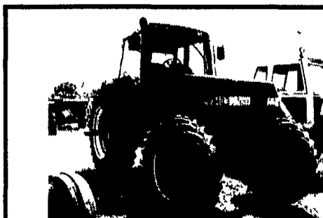
Case IH 7240 4x4, 195 HP, 1100 Hr $68,500