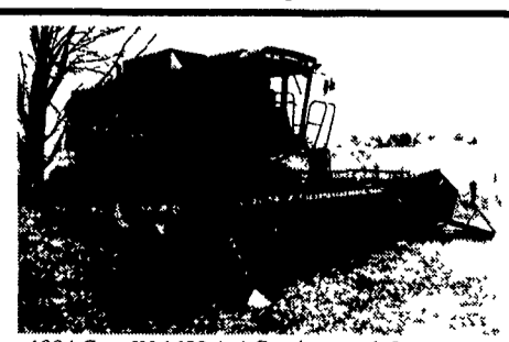
1994 Case IH 1688 4x4 Combine with 8 row corn 15' flex head, 20' flex head, 400 Hr $148,000