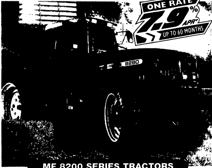
MF 8200 SERIES TRACTORS