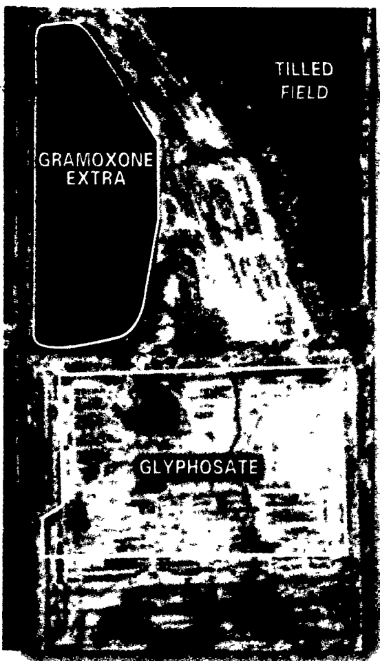
14 DAYS AFTER APPLICATION - MAY 10