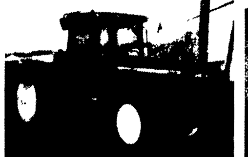
John Deere 8300, MFWD, Cab, Duals, Fully Loaded, 490 Hrs., Weights, Like New

Location: 3266 Maytown Road, Marietta, PA. From Columbia Exit of Rt. 30 follow Route 441 North approx. 4 miles to Rte. 743 turn right to farm on right. From Elizabethtown (Rte. 283) follow Rte. 743 south approx. 8 mi. thru village of Maytown to farm at corner of Rte. 743 and Fuhrman Road. East Donegal Township, Lancaster County, PA.