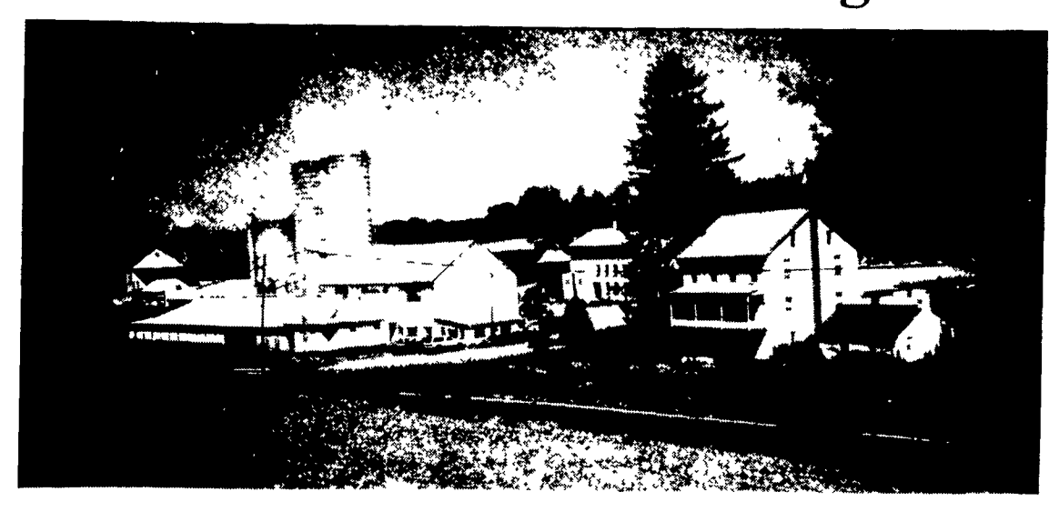
Del-Jame Farm near Hamburg in Berks County is a 1999 Dairy of Distinction winner. Since the program began in 1987 in Pennsylvania, more than 700 farms have been given this farm beautification award. Entries are now being received for the year 2000 program. Take time to enter your farm now.

Judging is conducted during the month of May. Award winners are announced during local June Dairy Month activi-