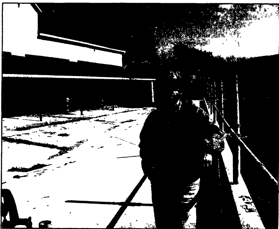
The AFT farm uses a concrete feed pad measuring about 100 feet long by 22 feet wide, with an additional area measuring 65 feet by 12 feet, comprising a feed area for 108 cows with two feet of room per cow, Moyer noted. The pad can accommodate about 130 cows. Moyer hosted the Beginning Dairy Graziers School in mid-October at the farm.