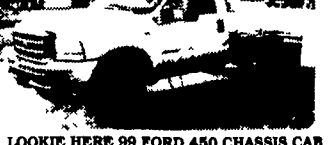
LOOKIE HERE 99 FORD 450 CHASSIS CAB 4 Wheel Drive, Heavy 15,000 GVW, Powerstroke Turbo Diesel, 6 Sp Trans, Short 141 WB 60 C A Runs Strong & Ready To Work