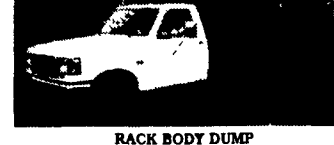
RACK BODY DUMP VERY NICE 99 FORD F350 Only 48,000 Clean Miles, 351 V8, AT, 12 Ft Body, Big Swing Out Mirrors