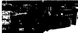
97 CHEVY 3500 HD DUMP TRUCK Only 28,000 Miles, 6.5 Turbo Del., Auto $23,900