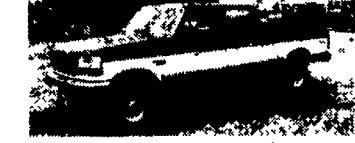
460 4 DOOR 96 FORD F250 XLT 4 Wheel Drive, Perfect, Only 11,000 Miles, 460 V8, Auto, A/C, Loaded XLT, Aluminum Wheels, Factory Tow Pkg., A Must See