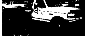
FORD CHASSIS CAB - READY TO WORK 2 AVAILABLE 95 F350 & 94 F-Super Duty Diesel Power, 5 Spd Trans., Long 161 WB, 84" C A Call For Details