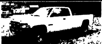
QUAD CAB, 99 DODGE 2500 4X4 ST Only 7000 Miles, 24 Valve Cummins, Turbo Diesel, AT, A/C, Cloth Seat, Vinyl Floor, All Doors Open, Tow Pkg, Remaining New Tk Warranty, Great Tk., Great Price $29,900