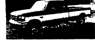
4 WHEEL DRIVE, 96 FORD F250 SUPER CAB Great Price on a Nice Truck, Powerstroke Turbo Diesel, AT, A/C, Loaded, XLT, Aluminum Wheels, Limited Slip Gear, $23,900