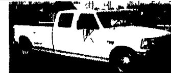
CREW CAB DUALY DIESEL 96 FORD F350 CREW CAB DUALY Powerstroke Diesel, AT, XLT, Aluminum Wheels, Very Nice, Only 43K Miles