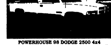
POWERHOUSE 98 DODGE 2500 4x4 24 Valve Cummins Turbo Diesel, AT, Heavy Duty, Tow Pkg., Limited Slip 4 10 Gear, Loaded with Options, Chrome, Good Lookin' & A Pleasure To Drive $25,900