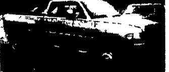
TOW MACHINE 98 DODGE 3500 CLUB CAB DUALY 4 Wheel Drive, This One Will Pull The Big Load, Cummins Turbo Diesel, AT, A/C, All Power Equipment, Heavy Duty Dana Frt. & Rear Axles, Tow Pkg.