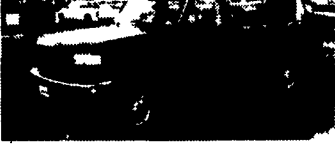
5 SP. HEAVY DUTY 96 FORD F250 4 WHEEL DRIVE Great Running Truck, Fuel Inj 351, 5 Sp., O/D Trans., Air Conditioning, Tow Pkg., Very Nice Tk. $16,900