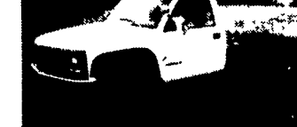
4x4 CHASSIS, 98 CHEVY K3500 4x4 Short Wheelbase Great Gooseneck Hauler, 12,000 GVW, High Output 6.5 Turbo Diesel, 5 Sp., A/C, 4 10 Gear