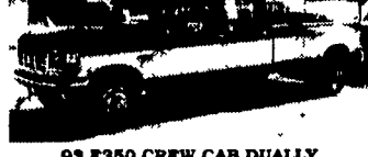
93 F350 CREW CAB DUALY 460 Auto, Fully Equipped, Tu-Tone Paint, Got To See This One! $17,900