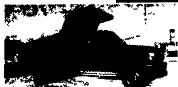
4x4 DUMP 95 FORD F350 Powerstroke Turbo Diesel, AT, A/C, Landmaster Body, Dump & Utility Cabinets

PHONE 717-274-2000 Toll Free 1-800-650-1420