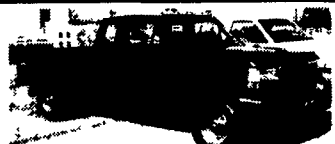
DIESEL SUPER CAB 4 WHEEL DRIVE 97 FORD F250 XLT, Super Sharp, Only 30,000 Miles Remaining New Tk Warranty, Powerstroke Diesel, AT, A/C, 40/20/40 Seat Aluminum Wheels, Tow Pkg