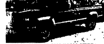
5 SP GMC - 98 GMC K2500 SIERRA Heavy Duty 3/4 Ton, High Output 6.5 Turbo Diesel 5 Spd, A/C, 22,000 Miles, Nice Clean Tk., Ready For You