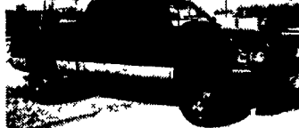
SHORT RED QUAD CAB - 98 DODGE 2500 4X4 Super Nice, 22,000 Miles, 24 Valve Cummins, Auto, A/C, Loaded Laramie SLT Tow Pkg., Real Nice To Drive