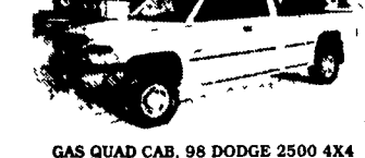
GAS QUAD CAB, 98 DODGE 2500 4X4 360 Magnum, V8 AT A/C Tilt, Cruise Power Everything, Aluminum Wheels, Tow Pkg Back Doors Open, A Pleasure To Drive