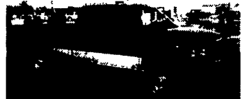
5 SP. QUAD CAB 4 WHEEL DRIVE 99 DODGE 2500 Laramie SLT, 24 Valve Cummins, 5 Sp., A/C, Tilt, Cruise, Power Everything, CD Player, 4:10 Limited Slip Axle, Tow Pkg, Remaining New Tk. Warranty