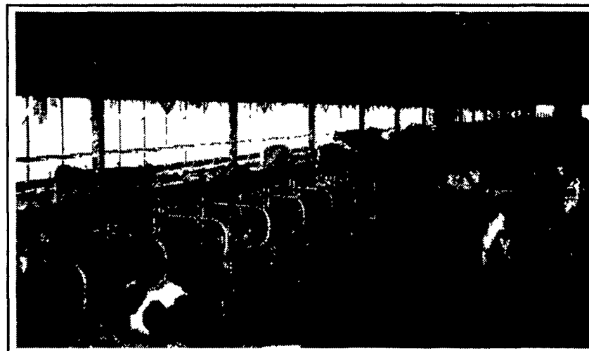
Long Core Cattle Waffle Slats